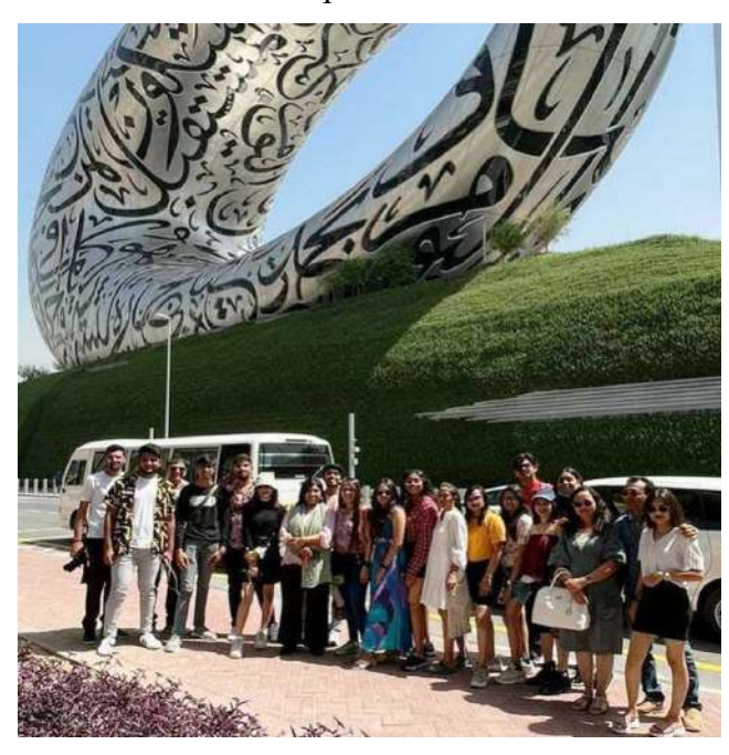
Documentary and Debate by BMCA

More over students also visited Royal palace, Ferrari world, Sheikh Zayed mosque, Louvre Museum and learned the ideology of temporary structure, Pavilions and landscape architecture.