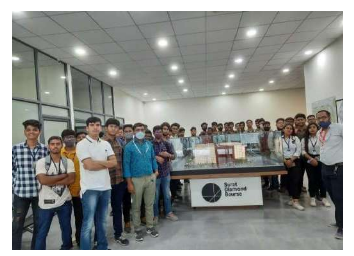
40 students from 4<sup>th</sup> & 6<sup>th</sup> semester including 2 faculty members took the advantage of the same.

One-day industrial visit at Surat Diamond Bourse, Ploat No.177/P, Dream City, Khajod, Surat, was organized by the Department of Civil engineering of BMP on 12th March-2022.