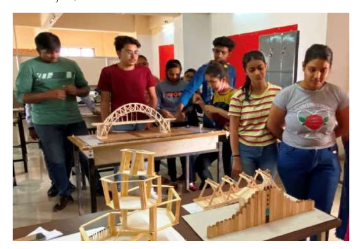
First year students including Diploma & Bachelor of Architecture, Interior Design and Masters of

The session was part of Welcoming Summer Semester program and was conducted on 22<sup>nd</sup> March, 2022.