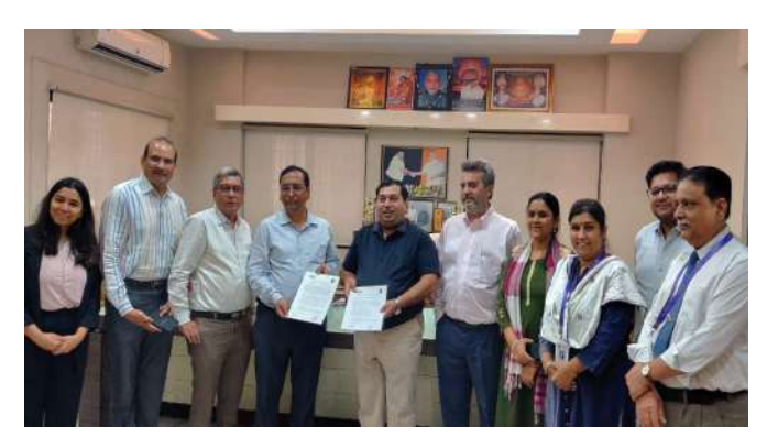
Vasant Panchami Celebration by BMCET & MSCET

To raise the awareness and to satisfy the rising demand of Valuation Experts in the various fields, the University and GAA decided to run courses related to said domain to fill up and bridge the gap in knowledge and prepare professionals in the valuation fields. BMU and GAA will jointly run the courses of certificate level and post-graduation level on said domain MOU was signed on 3<sup>rd</sup> March-2022 in presence of the top management of the Bhagwan Mahavir University and GAA.