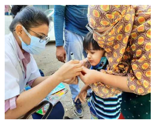
International Women's Day Celebration by BMCN

Students Nurses' Association of B.M College of Nursing observed International Women's Day on 8<sup>th</sup> March-2022 at Seminar Hall of B.M College of Nursing in coordination with Community Health Nursing Department. Faculties & Students conducted workshop on different topics. The health issues of women like Breast cancer, cervical cancer, Osteoporosis, Depression and Heart Disease were chosen as important health issues to be focused on. After the programme, students of second year B.Sc. nursing visited community area and distributed