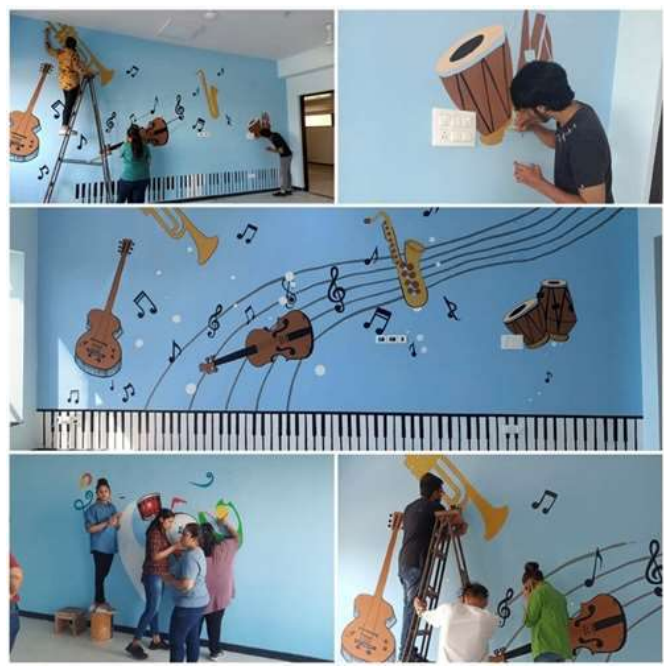
International Tour-Dubai World Expo by BMCA

From 10<sup>th</sup> March-2022 to 17<sup>th</sup> March-2022; 20 Students including faculties of Architecture and